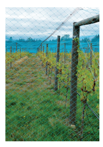
Above: A Smart Net protects a young vineyard from birds and other aerial predators.

The netting is tied polyethylene with 7/8" diamond shaped holes. The netting comes in widths of 20', 32', 40', 50' and lengths of 337' and 531'. For smaller plots, the netting also comes in a 50' x 50' and a 50' x 100' size. This netting is superior to its competition with the design loops woven on the edges with a threading string already installed. This string allows easy threading on the support wires. The 7/8" diamond shaped holes are the optimum size to keep birds out without letting them get caught in the netting.